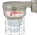
Wall w/ 7-3/4" Refractor & Guard