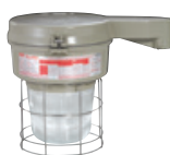
Stanchion Straight w/ 7-3/4" Refractor & Guard