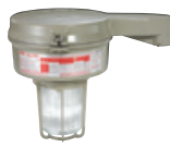
Stanchion Straight w/ 5-1/2" Refractor & Guard