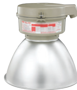
Stanchion 25° w/ Enclosed Reflector