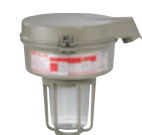
Stanchion 25° w/ 5-1/2" Globe & Guard